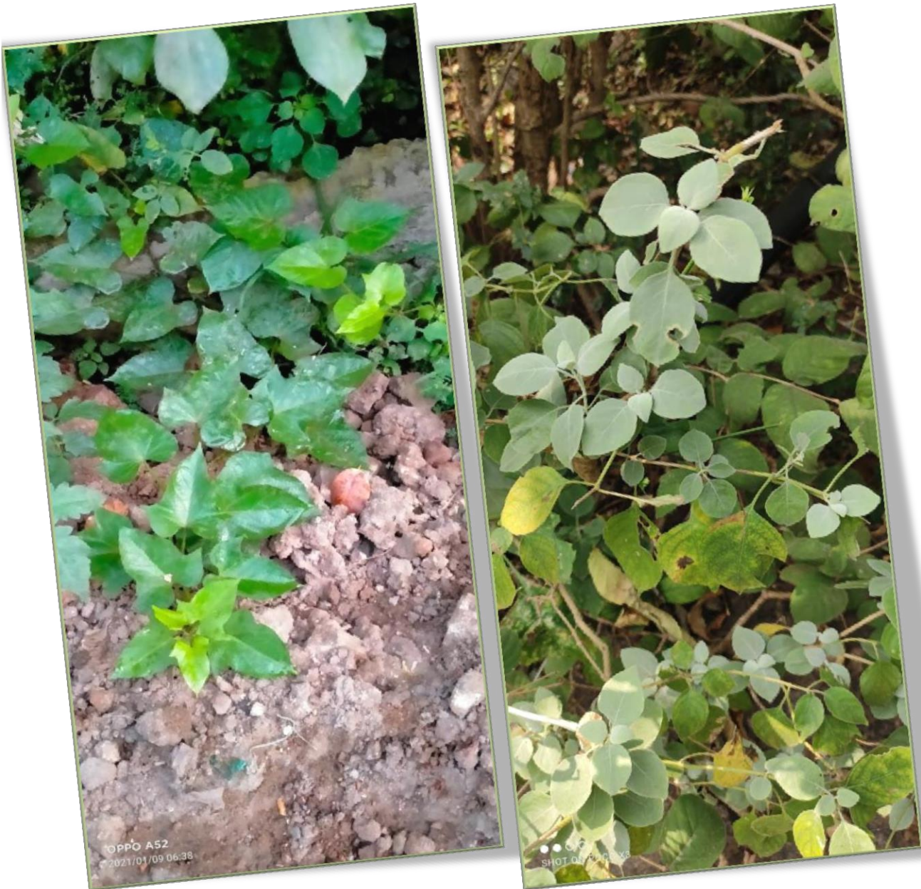
Ipomoea batatas and Myrtaceae family members